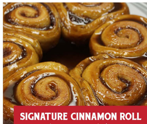
SIGNATURE CINNAMON ROLL Frosted or Caramel. $4